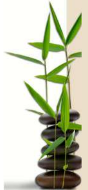
* Helen Keller

Medical Mission Matters 2F NIG Bldg, 32 Mabini St Iloilo City, Philippines 5000 0919.910.4623