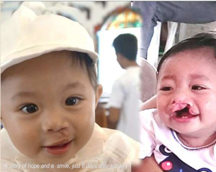
A story of hope and a smile, just 8 days after surgery.

Innovation is driven by commitment: to leadership, to collaboration, to culture, and systems. It is the result of fulfilling our promise to improve or change the way things are today!