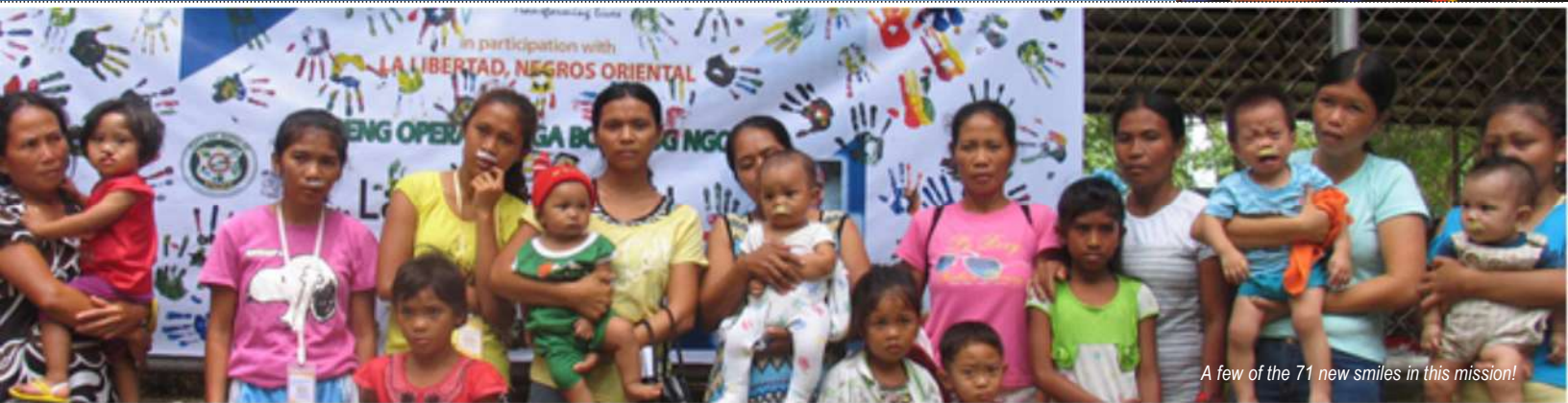
A few of the 71 new smiles in this mission!

Just one of our experienced surgical teams can create up to 12 new smiles